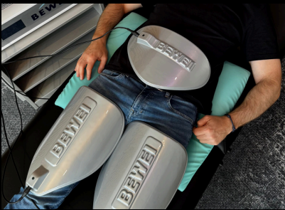
BEWEI Radiofrequency Cell Refresher

In addition to muscle training, we offer a range of advanced wellness and longevity treatments – including mechanical lymphatic drainage, BEWEI Radiofrequency, IHHT (intermittent hypoxia-hyperoxia training), pelvic floor training, as well as red, blue, and infrared facial light therapy – all powered by cutting-edge technology for lasting well-being.