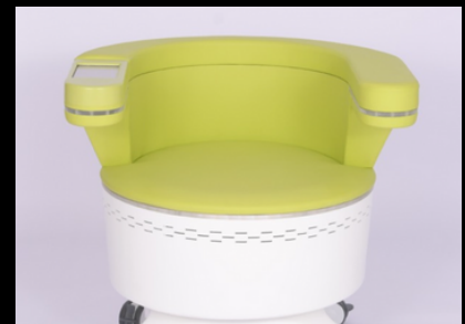
Pelvic Floor Training