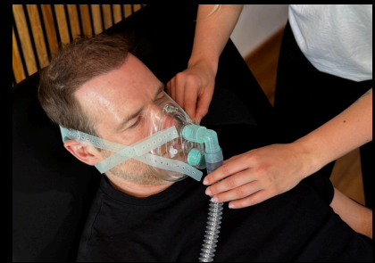
Intermittent Hypoxia- Hyperoxia Training