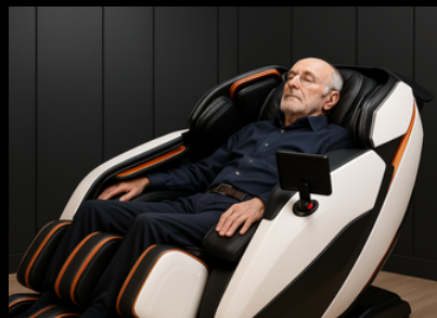
Hyper Massage Relax Chair